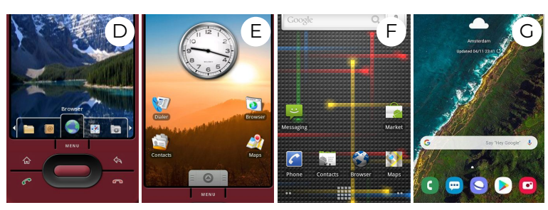
Figure 3: Some designs, both inside and outside of academia, expand on the Desktop Metaphor (left); for example, BumpTop's virtual 3D desktops (a) and literal stacking and piling metaphors (b, c) [1]. Android (right) used metaphors much more loosely: The app menu was originally accessed through a physical button (d), then a drawer metaphor (e), and then by clicking an iconic representation of the menu (f), before abandoning visual metaphor all together and using a swipe gesture instead (g).

of the Quantified Self paradigm, leading human receiving agents to misinterpret aspects about themselves or allow the technological communicating agent to overgeneralise their experience [82].