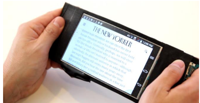
Figure 1. ReFlex, a flexible haptic smartphone.

DOI: http://dx.doi.org/10.1145/2839462.2839494