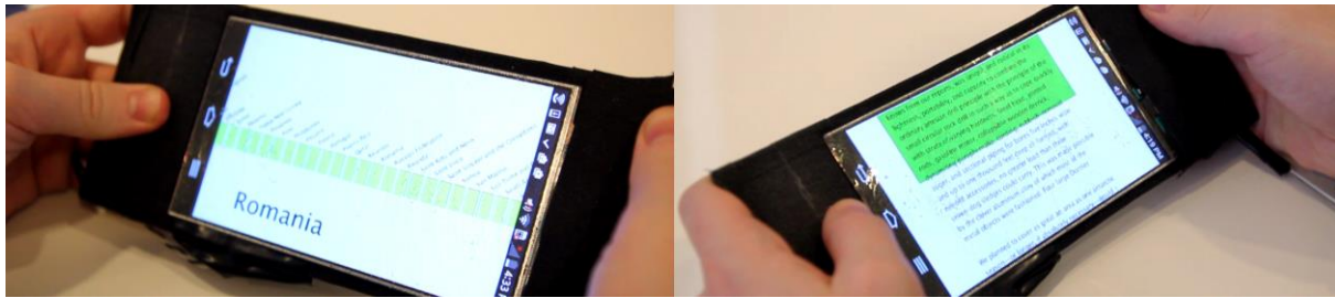
Figure 3. Left: Using A-RC for off-screen browsing of large lists, and combination R-PC for selecting on-screen items in the list. Right: Using R-PC for scrolling a text, and A-RC for annotating items.