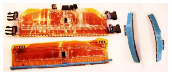
Figure 3 – Prototypes (left) and final version (right) of projected 2D touch sensor for interactions on the wrist.

We created a one dimensional array of alternating IR emitters and photo-transistors (Figure 1, right & Figure 3). For our emitter we chose the SFH 4045N by Osram. The specific emitter was chosen because of its wavelength (950nm), its relatively small viewing angle ( 18^\circ ) and because it can be mounted at right angles. For the receiving element we chose the PT12-21C/TR8 by Everlight, as it closely matched our emitter's wavelength (940nm), has a wide viewing angle ( 120^\circ ) and can also be mounted at right angles. We found that this setup maximized the resolution of the sensor: the small viewing angle of the emitter reduced the ambient saturation of IR light, while the wide angle of the receiver enabled us to use software interpolation between